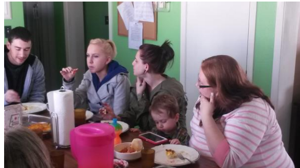
Here are some of the staff members enjoying a joint staff breakfast/meeting recently held at the Lander home.

Our website has been updated in many areas, with all of our new employees up on the site along with activities the staff and residents have been involved with. I encourage you to hop on the website and take a look.