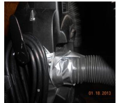
The Boy's solution to a well-used vacuum

New Vacuum for Boys Group Home New Mattresses for Boys Group Home New Carpet/Flooring in living room for Boys Group Home.